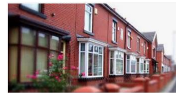
Newark and Sherwood District Council newark-sherwooddc.gov.uk