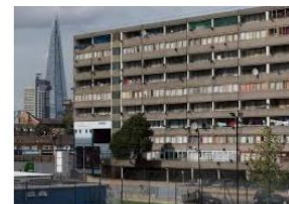
social homes to fall by 230,000 by 2020 ... independent.co.uk