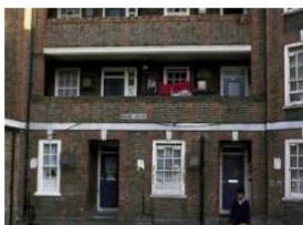
UK spends less on social housing than ... mirror.co.uk