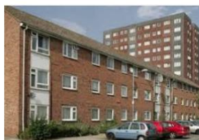
housing rules to control immigration ... gov.uk