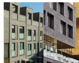
transforming social housing – stories ... architecture.com