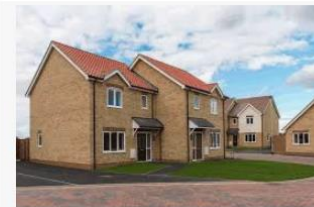
Group increases new affordable housing ... sanctuary-group.co.uk