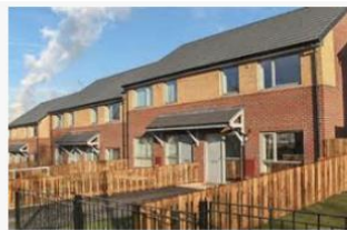
affordable homes released - GOV.UK gov.uk