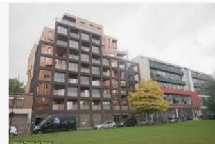
affordable' housing property goes ... dailymail.co.uk