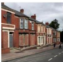
Why we need more social ho... england.shelter.org.uk