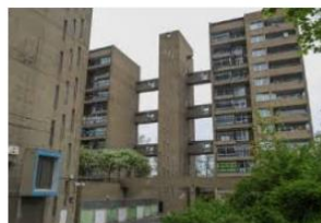
social housing waiting lists ... localgov.co.uk