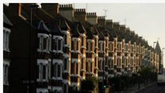
affordable housing ... bbc.co.uk