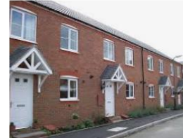
Glasgow affordable housing boost | N... architectsjournal.co.uk