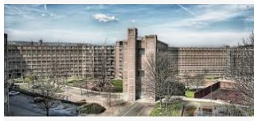
Affordable housing a top priority for ... uk.kantar.com