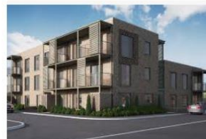
Latest phase of affordable housing ... bpha.org.uk