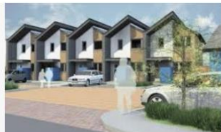
zero-carbon affordable housing scheme ... placemakingresource.com