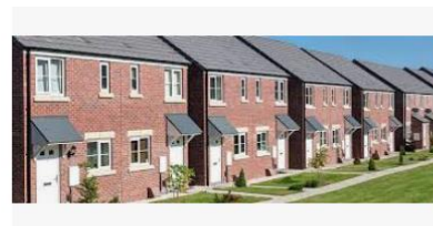
UK councils 'increasingly unable' to ... theplanner.co.uk