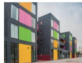
Creating a new generation of Social H... psbj.co.uk