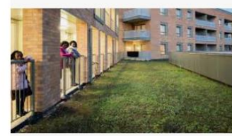
affordable housing ... london.gov.uk