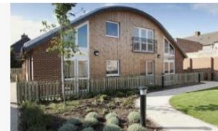
Affordable Housing Meets Green Building ... inhabitat.com