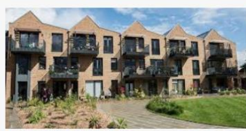
affordable homes for Londoners ... london.gov.uk