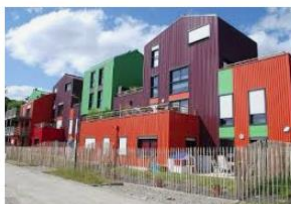
Are you eligible for social housing? thetenantsvoice.co.uk