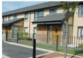
Affordable Homes Programme to transfer ... gov.uk