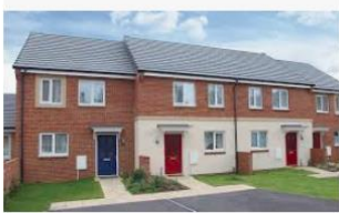
Bovis Homes consultation bovishomes.co.uk