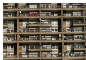
Housing associations face selling off ... telegraph.co.uk