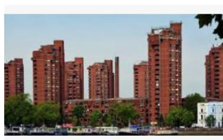
social housing sector has ... blogs.lse.ac.uk