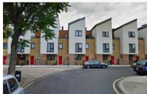
Affordable Housing, Birmingham ... aparchitects.co.uk