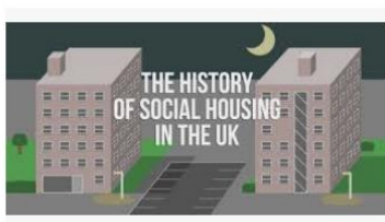
A History Of Social Housing In The UK...