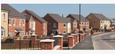
Affordable housing DIY | The Planner theplanner.co.uk